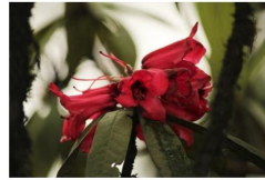
Fig. 1. (Sukhia Simana)