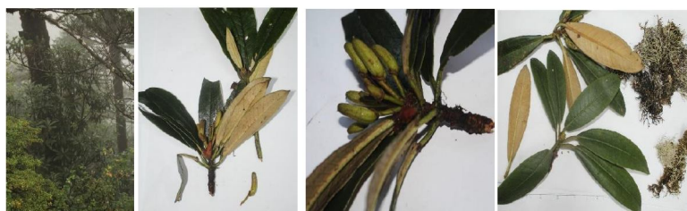
Fig.12 Fig. 13 Fig. 14 Fig. 15 Figs.12-15: Fruiting phenology & Lichen-association with stem observed along BK Bhanjyang-Sandakphu Road in Sept. 2019.