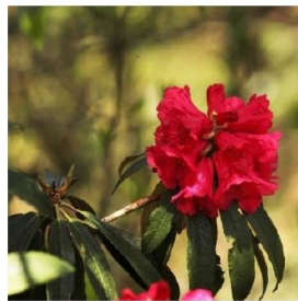
Fig. 9 (near Sandakphu)

Figs.1-8. Flowering phenology observation in R. arboreum subsp. arboreum in Darjeeling in May, 2019.