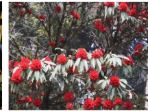
Fig. 3. (Darjeeling Town)