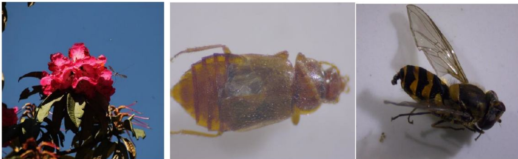
Fig. 36. Family: Tipulidae (Crane fly); Fig. 37. Family: Tipulidae; Fig. 38. Family: Coccinellidae

Figs. 34-38. Insect visitors observed in R. arboreum subsp. cinnamomeum var. roseum in and around Kalipokhri-B.K. Bhanjyang Road based on NET SWEEPING