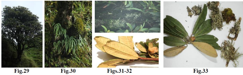
Fig.29 Figs.29-33: Lichen-Bryophyte-Pteridophytic association with stem observed at Tumling in Sept.19

Figs.21-33. R. arboreum subsp. cinnamomeum var. roseum in Darjeeling Himalaya in May-September, 2019 (Tonglu-Kalipokhri-BK Bhanjang).