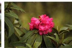
Fig. 5. (Gairibas)