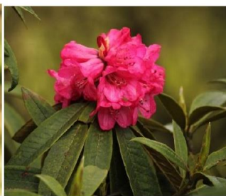
Fig. 10 (near Sandakphu)