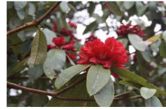
Fig. 4. (Lebong)