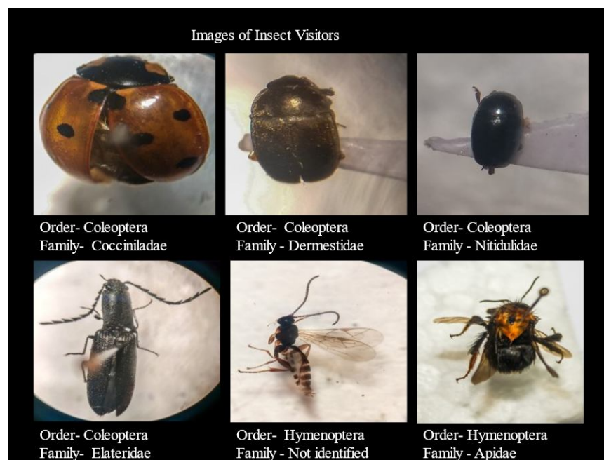
Fig. 40. Insect visitors observed in R. arboreum subsp. arboreum in and around Kalipokhri-B.K. Bhanjyang Road based on NET SWEEPING