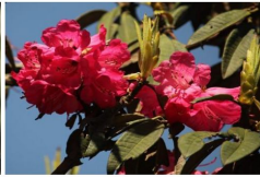
Fig. 2. (Kalipokhri road)