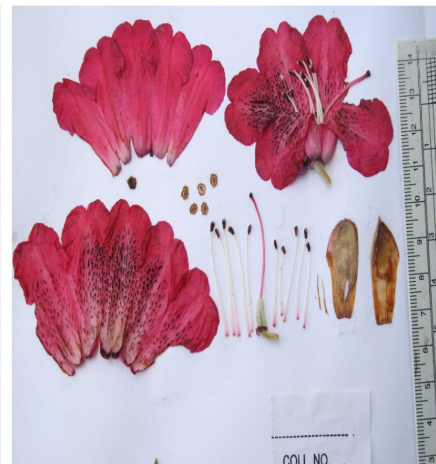
Fig. 8. (Tonglu)

Figs.1-8. Flowering phenology observation in R. arboreum subsp. arboreum in Darjeeling in May, 2019.