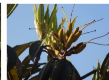
Fig. 6. (Gurdung: immature fruiting)