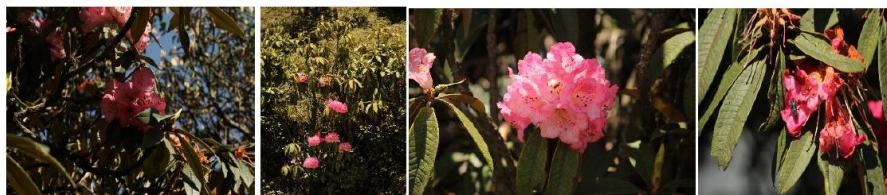
Fig. 25 (Tumling) Fig.26 (BK Bhanjyang) Fig.27 (BKB) Fig.28 (BKB) Figs.25-28: Flowering phenology observation in May, 2019