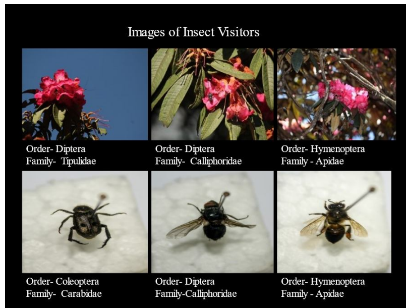
Fig. 39. Insect visitors observed in R. arboreum subsp. cinnamomeum var. cinnamomeum in and around Kalipokhri-B.K. Bhanjyang Road based on PAN TRAP & NET SWEEPING