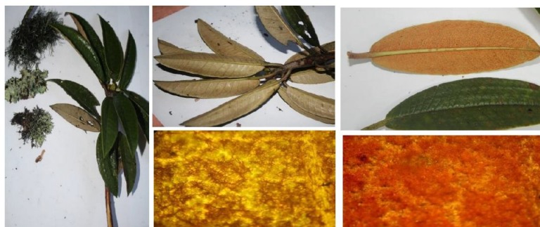
Fig. 16 Figs.17-18 Figs.19-20 Fig.16: Lichen-association observation at Kalipokhri-BK Bhanjyang Road in Sept. 2019. Figs.17-18: Leaf abaxial surface showing golden yellowish scales observed at BK Bhanjyang in Sept. 2019. Figs.19-20: Leaf abaxial surface showing brownish scales observed at Sandakphu-Gurdung Road in Sept. 2019.

Figs.9-20. R. arboreum subsp. cinnamomeum var. cinnamomeum in Darjeeling Himalaya in May-September, 2019 (Kalipokhri-BK Bhanjang-Sandakphu-Gurdung).