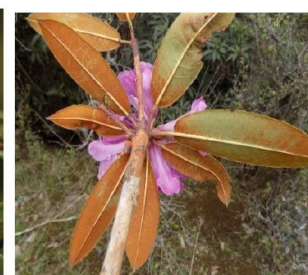
Fig. 11 (Sandakphu-Phalut Road)

Figs.9-11: Flowering phenology observation in May, 2019