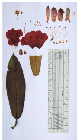
Fig. 7. (Meghma)